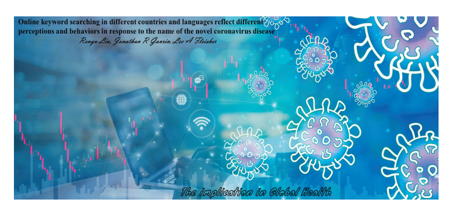
Photo: We use this art work to represent our work to demonstrate that online keyword searching trends reflect perceptions and behaviors in response to the name of the novel coronavirus disease. The original image is obtained by Dr Renyu Liu from Shutterstock (https://www.shutterstock.com/home) with an Enhanced License for unlimited editing and usage).

In this viewpoint, we used three online search engines in three different languages: Google used in the United States and Japan, and Baidu used predominantly in China to investigate the perceptions and behaviors in response to the name of the novel coronavirus disease in different countries and culture. All engines offer statistical data on the trends of online searches: Google Trends in English and Japanese, and Baidu Index in Chinese. We found that the medical term "COVID-19" is not commonly used as a search keyword in any of the three countries we examined. There is a clear disconnect between "COVID-19" with either "pneumonia" (the severity of the disease and the effect on the respiratory system) or "mask" (the tool to defend against the pandemic). "Coronavirus" is the most used keyword in the US and is associated with "stock" rather than "mask". "Coronavirus" is the most used keyword in Japan and is associated with "mask" rather than "stock". "Pneumonia" is used China and is associated with "mask" rather than "stock". Such differences reflect different perceptions of the disease and could potentially contribute to the different dynamics of public behavior influencing viral spread and containment.