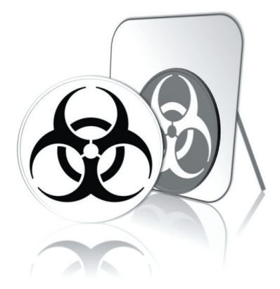
Photo: Two sides of the same coin (from Lionel Koch's collection, used with permission).

The use of some spontaneously rare agents could denote a criminal origin, as it has been the case with the use of Bacillus anthracis during the Amerithrax crisis in 2001 [20], and, to a lesser extent, with the Aum Shinrikyo sect in Japan in 1993 [21]. However, the agent is not a sufficient criterion to identify natural or induced biohazard. For example, the Rajneesh sect used a quite common Salmonella enteric [22] to perpetrate attacks, and some bacterial toxins are considered as a potential warfare agent precisely because of their high prevalence [23]. In sharp contrast, recent natural outbreaks involved top select agents like Ebola virus in West Africa in 2014-2015 [3] or Yersinia pestis causing pulmonary plague in Madagascar in 2017 [24]. Even the emergence of a peculiar new strain cannot be a stand-alone criterion to differentiate both events. Indeed, even if there is no evidence of using such agents through history, natural agents can be modified by humans to increase their transmission, lethality or drug resistance capabilities