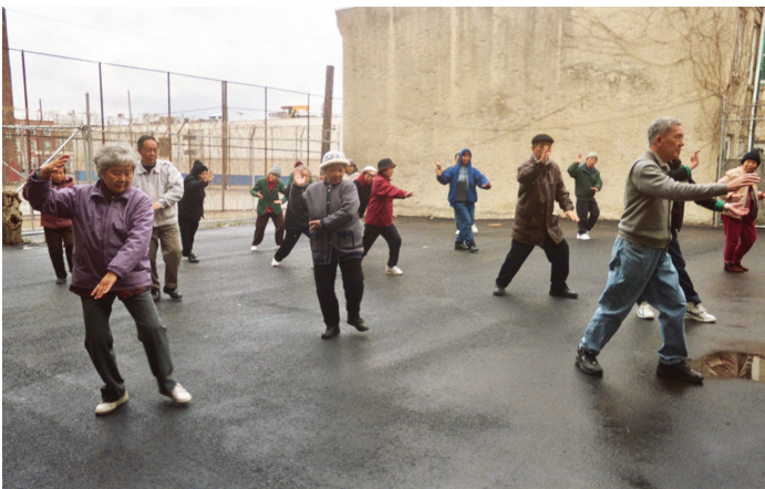
Photo: A group of Chinese seniors practicing the art of Tai Chi in order to increase their level of physical fitness.

The second stage spans from 1994-2009. During this time, China started to implement health promotion and community prevention efforts, made progress in NCD prevention and public health, and developed preliminary surveillance systems. The MoH Bureau of Epidemic Prevention was renamed to the Bureau of Disease Control and Prevention in 1994. The Division of Chronic and Non-communicable Disease Control and Prevention was established the same year. In 1996, the China Academy of Preventive Medicine (CAPM) created the Office of Chronic Disease Control and Prevention and Health Promotion. CAPM became the Chinese Center for Disease Control and Prevention (China CDC) and established the National Centre for Chronic and Non-Communicable Disease Control and Prevention (NCNCD) in 2002. The China CDC also created the Division of Chronic Disease Prevention and Community Health in 2006, which provided overarching organization and guidance for NCD prevention and control [12]. China ratified the WHO Framework