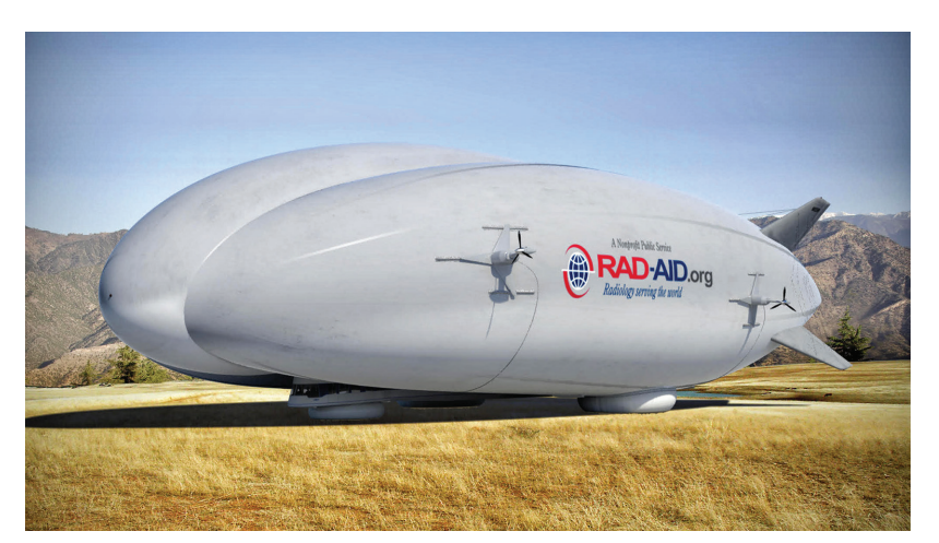
Photo: The RAD-AID medical hybrid airship (Credit: RAD-AID International, used with permission).

of over 1500 miles. The MHA program promotes operational sustainability by establishing bases of operation for the resupply of equipment and transfer of personnel. The appropriateness of provided radiology services to outreach areas will be ensured through the use of the RAD-AID Radiology-Readiness Assessment, to assess the existing radiology structure and health care needs of a specific region prior to designing and planning an outreach project [9]. The MHA program will also use geographic information systems (GIS), which manage and interpret geographical data for analysis, as a planning tool to determine potential landing zones for the airship [4]. Moreover, the MHA has a lower