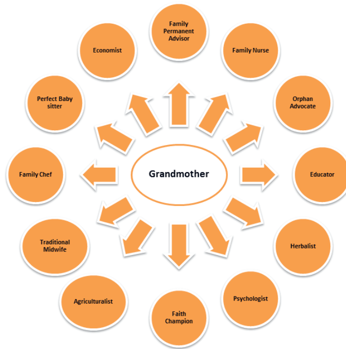
Figure 1. Summary of roles played by grandmothers in Africa.

well as practical skills to heal. Learning to heal is not only embedded in everyday practice and in social relations, but is also a moral and emotional process in Africa [13].