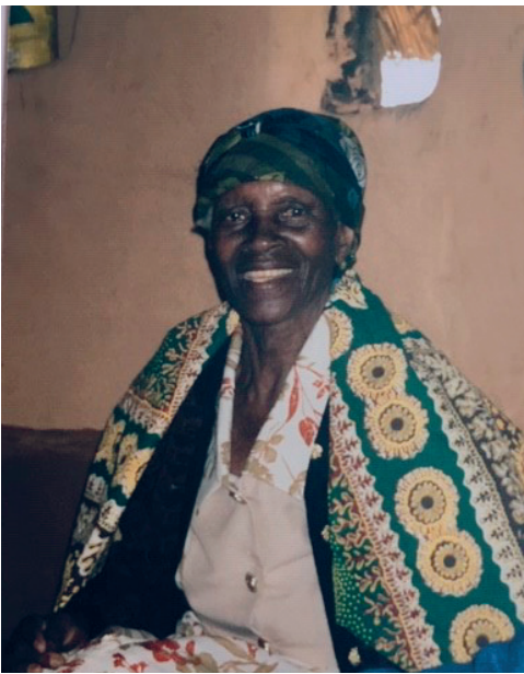
Smiling, valued and useful to the end – despite Parkinsonism and mobility issues. My wish for every-one getting older (meaning all of us).

Throughout history, traditional birth attendants have been the main health care providers for women during childbirth in Africa. They attend to the majority of deliveries in the rural areas of developing countries. When a woman is pregnant, who best can answer all the questions except grand mum, who herself has undergone the experience if not several times and over the years has accompanied many. Traditional midwives have been an integral part of African medicine for centuries. Because African people still love and fear spirits, they bring in a complementary component to conventional health care service, hence they are highly respected in African communities as they perform cultural rituals and provide essential social support to women during childbirth [22,23]. With additional formal training, traditional midwives, these grandmothers can be considered an important part of the informal community health care system [22].