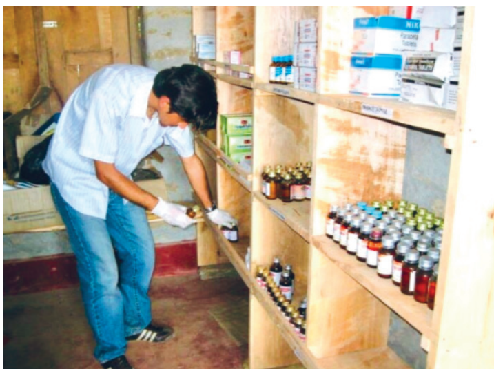
Photo: Accessing the stock of essential medicines in the remote health post.