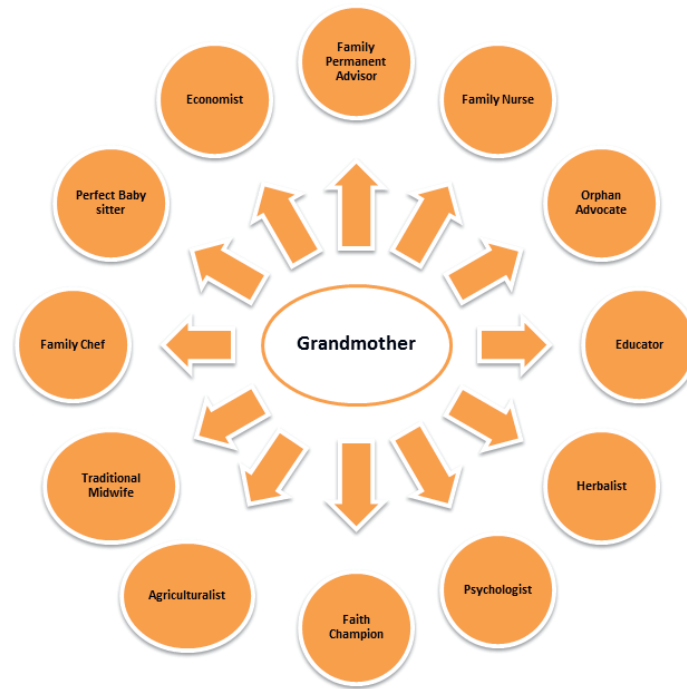
Figure 1. Summary of roles played by grandmothers in Africa.

well as practical skills to heal. Learning to heal is not only embedded in everyday practice and in social relations, but is also a moral and emotional process in Africa [9].