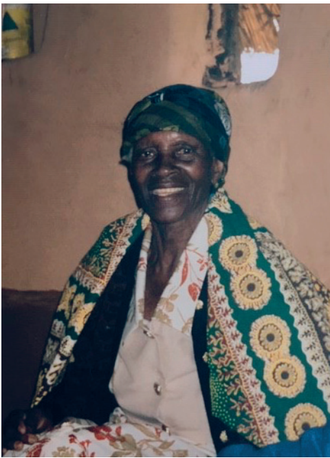
Smiling, valued and useful to the end – despite Parkinsonism and mobility issues. My wish for every-one getting older (meaning all of us).

Throughout history, traditional birth attendants have been the main health care providers for women during childbirth in Africa. They attend to the majority of deliveries in the rural areas of developing countries. When a woman is pregnant, who best can answer all the questions except grand mum, who herself has undergone the experience if not several times and over the years has accompanied many. Traditional midwives have been an integral part of African medicine for centuries. Because African people still love and fear spirits, they bring in a complementary component to conventional health care service, hence they are highly respected in African communities as they perform cultural rituals and provide essential social support to women during childbirth [19,20]. With additional formal training, traditional midwives, these grandmothers can be considered an important part of the informal community health care system [19].