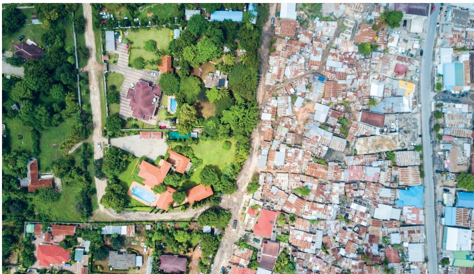
Photo: Unequal housing in Tanzania

Developing sustainable, national strategies for monitoring health inequalities ideally requires data capture at the local level [3], which can then be aggregated to provide regional and national data. It also requires innovative uses of existing data sources, including public sector administrative data, business data and new forms of data emerging from society's use of Information and Communications Technology (ICT).