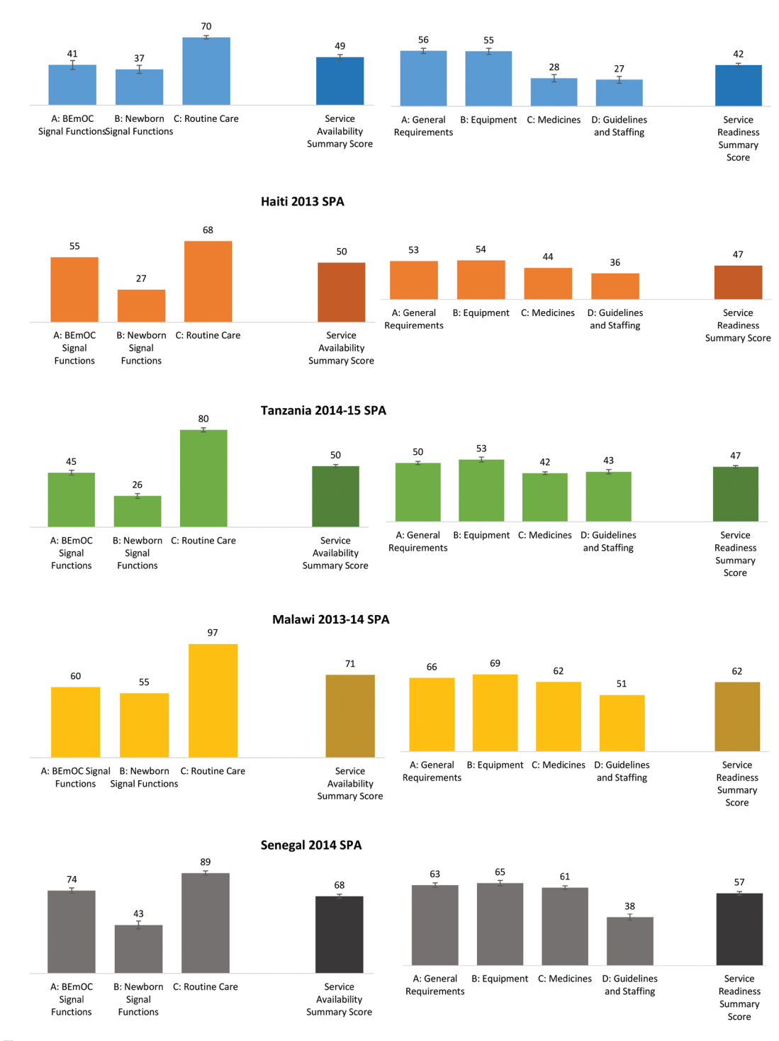
Figure 1. National service availability and service readiness summary scores, Bangladesh, Haiti, Tanzania, Malawi, Senegal. Confidence intervals are not shown for Haiti or Malawi, since those surveys were a census of all formal health facilities.

S6g in the Online Supplementary Document ). Overall, the summary scores for newborn care service readiness ranged from 42 in Bangladesh to 62 in Malawi.