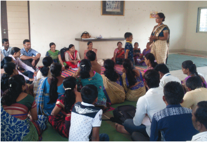
Photo: Field Research Assistant conducting community meeting in study area (source: VRHP, KEMHRC collection, used with permission).

VRHP has been conducting community-based research for the last five decades, yet SE was only recently planned systematically. Historically, VHRP has worked closely with local communities in areas where it conducts its public health research studies namely, administrative blocks of Ambegaon, Haveli, Junnar, Khed and Shirur in Pune district. These cover more than 600 villages and nearly a million people. SE activities were undertaken to fulfil VRHPs mission "to provide evidence-based, sustainable and rational health care solutions for the rural population using globally relevant community-based ethical research".