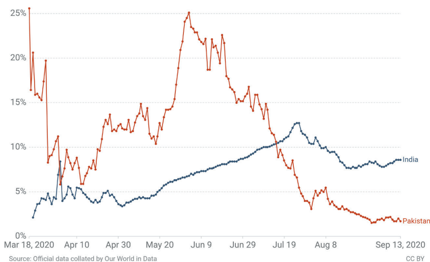
Figure 1. Positivity rate of COVID-19 tests for Pakistan in comparison to India [10]. The data are rolling 7-day average (the number of confirmed cases divided by the number of tests, expressed as a percentage). Tests may refer to the number of tests performed or the number of people tested, depending on which is reported by the particular country.

• A non-specific immunity due to immunization by various vaccines like BCG but there are still detailed clinical trials required to develop a causal relationship [11]. • The humidity in the current monsoon season and a comparatively higher temperature which is thought to attribute to the decreased spread of virus [12].