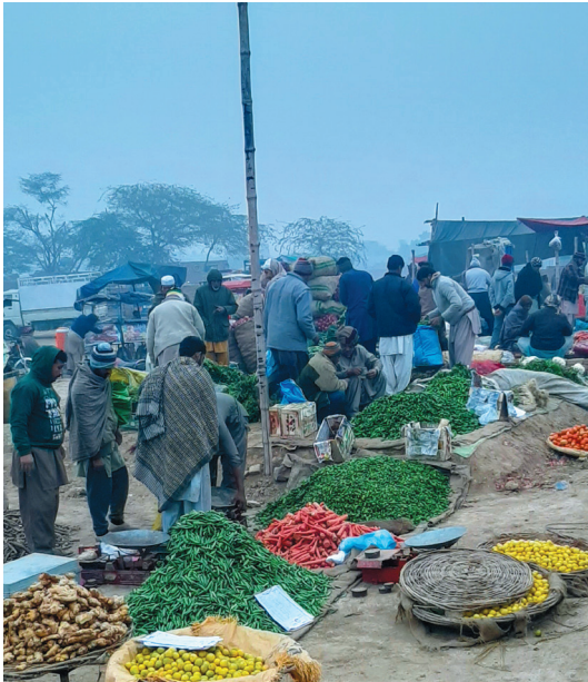
Photo: People busy in their routine and not adhering to preventive measures amidst the COVID-19 pandemic (from the author's own collection, used with permission).

Overall, lack of lockdown-regulations, negligible implementation of preventive measures, lack of preventive resources, lack of knowledge in the public, mass gatherings in worship places, and an already fragile health care system, had put Pakistan on a road destined to make it one of the worst hit countries by this pandemic [7]. A study by Imperial College London had predicted by various algorithms that Pakistan would report the highest number of deaths on the 10th of August 2020 with the total reaching 78 515 after which Pakistan would witness a decline [8].